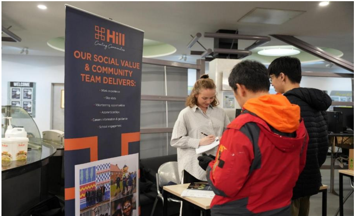
During the event, via repeat presentations, guests heard about how apprenticeships work, how to find an employer, entry requirements and opportunities.